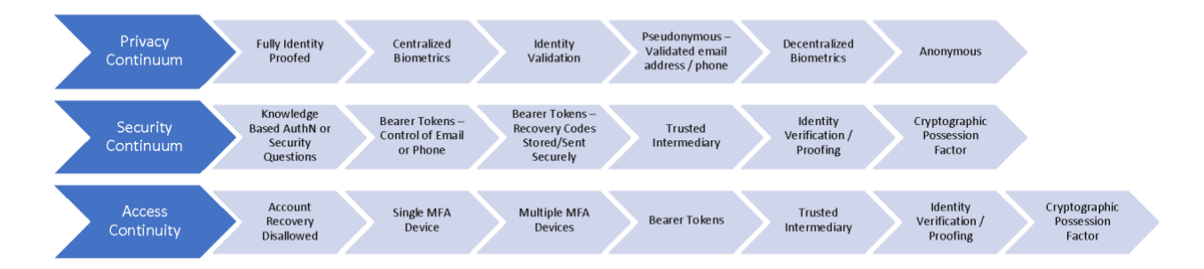
Figure 2: The three continuums of an Iron Triangle of Access Continuity. Moving from left to right on each continuum leads closer to the appropriate vertex of the triangle.

each vertex; movement toward the arrow is correlated with a higher score on the continuum toward the vertex in the triangle (values are relative, not absolute).