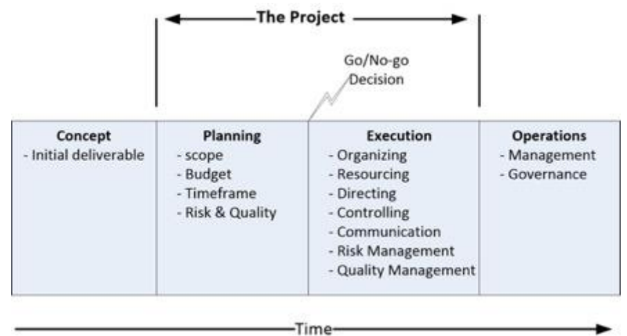
Figure 1 - The Project Lifecycle